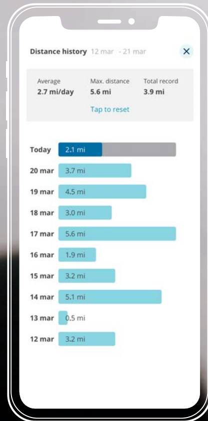
See how far you've come by reviewing your travel history