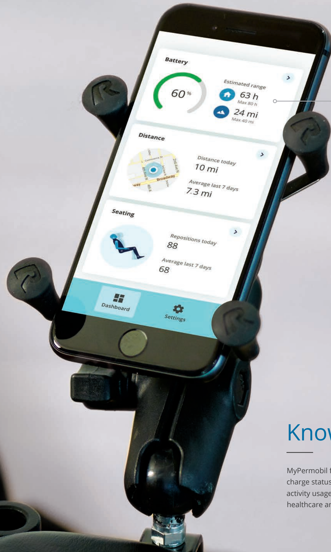
App dashboard makes key information available at a glance